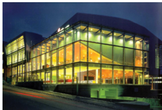
GSK Konferansesenter, Oslo.

Pictures from the conference centre can be found at www.gsk-konferansesenter.no