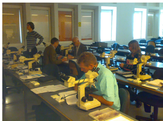
Individual studies and discussion